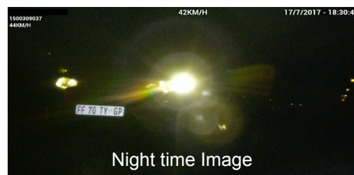
Night time Image